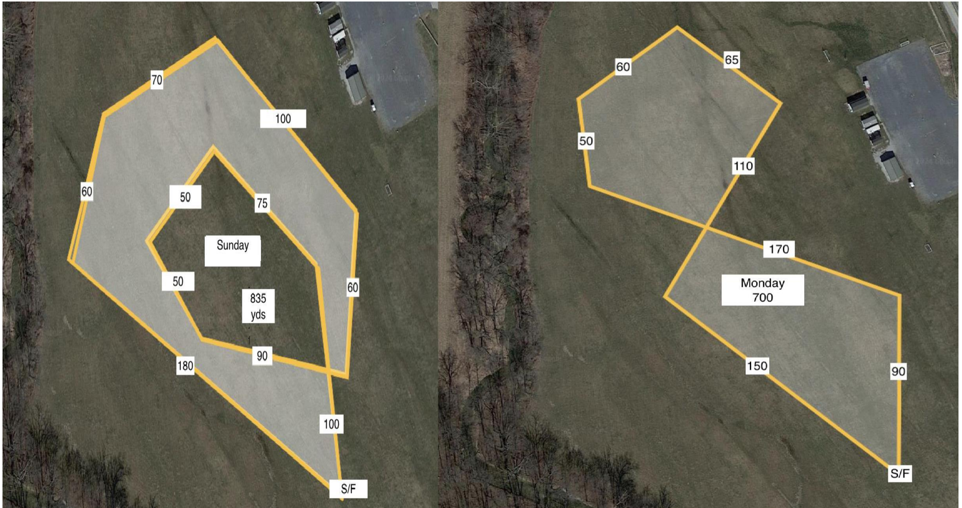
Course Plan Monday, 2, 2024, 700 yds

Practice will be offered on Saturday and Sunday Only after JC and QC runs, weather, equipment and time permitting. Cost is $5.00 per run. Practice will not be offered Monday